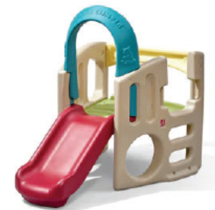
Sample Toddler Play Structure