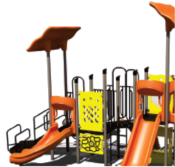
Sample Main Play Structure