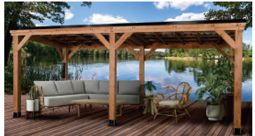
Sample Gazebo (Lake Not Included)